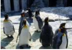
Asahiyama Zoo Penguin

Period 18Nov-8Apr Everyday (Except 30Dec-1Jan)