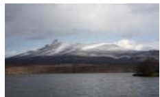
Onuma Quasi National Park

Hanabishi Hotel (7:55) / Heiseikan Kaiyotei (8:00) / Yunokawa Grand Hotel (8:05) / Heiseikan Shiosaitei (8:10) / Yunokawa Prince Hotel Nagisaeti (8:15) / Bourou Noguchi Hakodate (8:20) / Yumoto Takubokutei (8:25) / Hotel Hakodate Royal (8:40) / La Vista Hakodate Bay (8:45) / Hakodate Kokusai Hotel (8:50) / Loisir Hotel Hakodate (8:55) ⇒ Hokkaido Sea Tangle Museum (9:25-9:50) ⇒ Onuma Quasi National Park (10:05-10:35) ⇒ Hakodate Onuma Prince Hotel (10:45) ⇒ Oshamanbe Butsusan Centre Lunch (Own Expense) (12:15-13:15) ⇒ Niseko Road Station (Rest 10mins) ⇒ Otaru (16:45-18:15) ⇒ Sapporo Area Hotels (19:15-19:55 stop randomly) Century Royal Hotel / ANA Hotel Sapporo / Sapporo Tokyu Inn / Sapporo Tobu Hotel / Sapporo Prince Hotel Tower / Sapporo Excel Hotel Tokyu