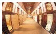
Abashiri Prison Museum

Memanbetsu Airport (①13:45 Connect flight from Haneda AIR DO 51 / ②14:45 Connect flight from Nagoya NH327) ⇒ Okhotsk Drift Ice Museum (①14:10-14:40 / ②15:10-15:40) ⇒ Museum of Northern Peoples (①14:45-15:45 / ②15:45-16:30) or Abashiri Prison Museum (①14:50-15:50 / ②16:50-16:40) ⇒ Abashiri Area Hotels (Arrive at ①16:00-16:20 / ②16:50-17:10 stop randomly) Kanihonjin Yuaisou / Abashiri Kanko Hotel / Hokutenno oka Lake Abashiri Tsuruga Resort ⇒ Oshin-Koshin Falls (from bus) ⇒ Shiretoko Area Hotels (Arrive at ①18:20-18:40 / ②19:10-19:30 stop randomly) Shiretoko Grand Hotel Kitakobushi / Shiretoko Prince Hotel Kazanamiki / Shiretoko Daiichi Hotel / Hotel Shiretoko