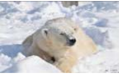
Asahiyama Zoo Polar Bear

Period 11Oct-6Apr Mon, Tue, Fri, Sun Everyday on 8-9Feb & 17-31Mar (Except 4-17Nov, 30Dec-2Jan)